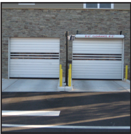
Shown with optional vision slats