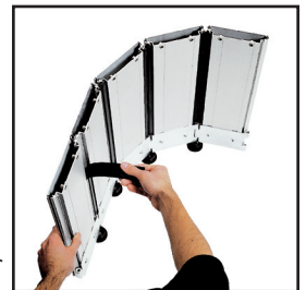
Integral rubber weatherseal