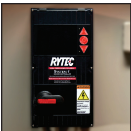
System 4 shown with optional rotary disconnect