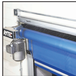
Edge-to-edge brush seal