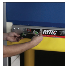
Automatic sleep mode extends battery life.