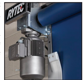
Direct drive motor