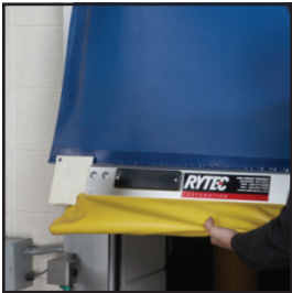
Quick-Set tabs for damage free release