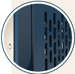
Punched for ventilation