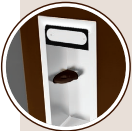
Single point latch