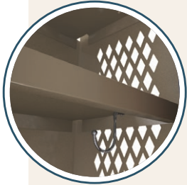
16 gauge galvalume coated