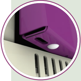
Quiet close feature