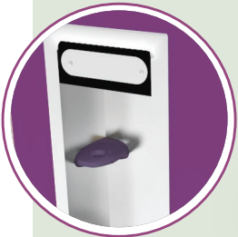
Single point latch