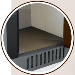
No rust bottoms