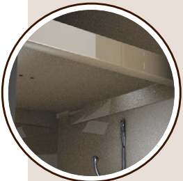
16 gauge shelves