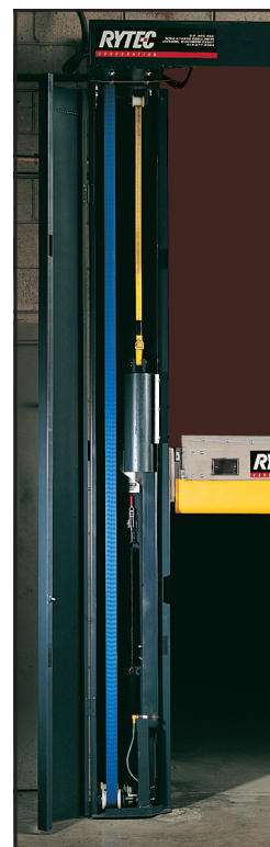
Patented System II independent counterbalance and tensioning system.