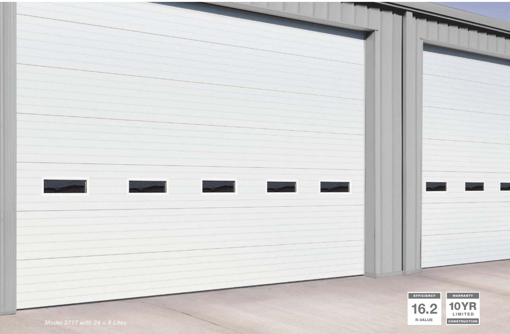
Model 3717 with 24 × 8 Lites