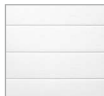
3717 Minor Ribbed Panel